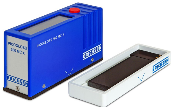
PICOGLOSS 560 MC-X gloss measurements on lacquered sheets

The PICOGLOSS 560 MC-X is operated by a round cell. When using a PC, the power supply is taken over by the USB interface of the PC.