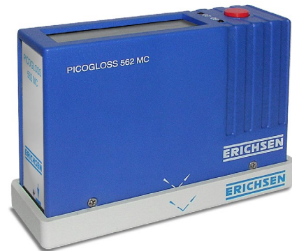
PICOGLOSS 562 MC

The PICOGLOSS 562 MC is operated by two round cells, the capacity of which is adequate for at least 10,000 measurements. When using a PC, the power supply is taken over by the USB interface of the PC.